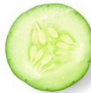
CUCUMBER HYDROLATE Cucumis sativus L.