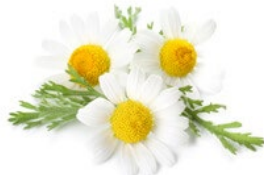
ROMAN CHAMOMILE HYDROLATE Anthemis nobilis