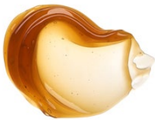
HEMP EXTRACT Cannabis sativa L.

Ingredients: AQUA, ANTHEMIS NOBILIS FLOWER WATER, CUCUMIS SATIVUS FRUIT WATER, GLYCERIN, CAPRYLIC/CAPRIC TRIGLYCERIDE, PRUNUS AMYGDALUS DULCIS OIL, COCO-CAPRYLATE, CANNABIS SATIVA BIOMASS EXTRACT, SUCROSE LAURATE, CITRUS AURANTIUM DULCIS FRUIT WATER, ALLANTOIN, CAMELLIA SINENSIS LEAF EXTRACT, PROPYLENE GLYCOL, SODIUM HYALURONATE, GLUCONOLACTONE, SODIUM BENZOATE, DEHYDROACETIC ACID, BENZYL ALCOHOL, XANTHAN GUM