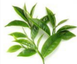
GREEN TEA LEAF EXTRACT Camellia sinensis