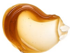
HEMP EXTRACT Cannabis sativa L.

Ingredients: AQUA, PERSEA GRATISSIMA OIL, STEARIC ACID, COCO-CAPRYLATE/CAPRATE, CAPRYLIC/CAPRIC TRIGLYCERIDE, CANNABIS SATIVA BIOMASS EXTRACT, DIMETHYL SULFONE, CETEARYL ALCOHOL, GLYCERYL STEARATE, AESCULUS HIPPOCASTANUM SEED EXTRACT, RUSCUS ACULEATUS ROOT EXTRACT, SORBITAN CAPRYLATE, PROPANEDIOL, BENZOIC ACID, SODIUM CETEARYL SULFATE, ROSMARINUS OFFICINALIS EXTRACT, BRASSICA CAMPESTRIS SEED OIL