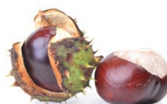
HORSE CHESTNUT EXTRACT Aesculus hippocastanum L.